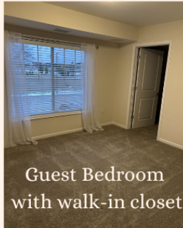
Guest Bedroom with walk-in closet