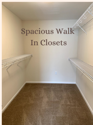
Spacious Walk In Closets