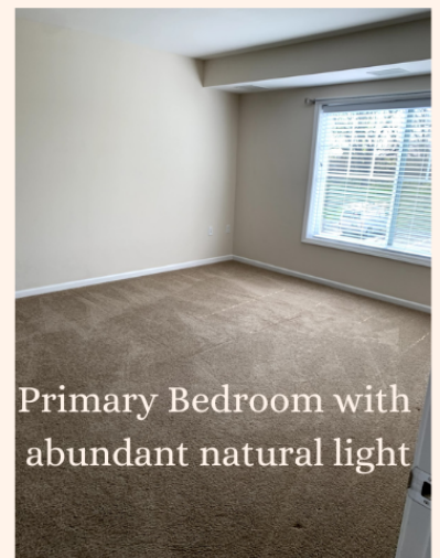
Primary Bedroom with abundant natural light